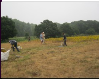
Ragwort clearing by members of the Town Council on Beccles Common— Councillors have to be hands-on in some cases. It was hot, hard work but the Common is looking so much better now.